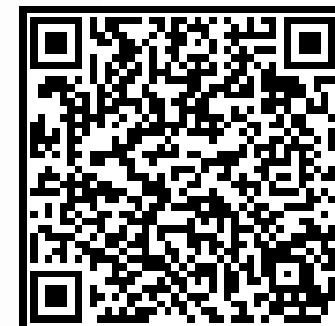
Holly Wise Chair

This WRAP certificate covers the facility with the address and production processes listed above. Please refer to the full audit report for details.